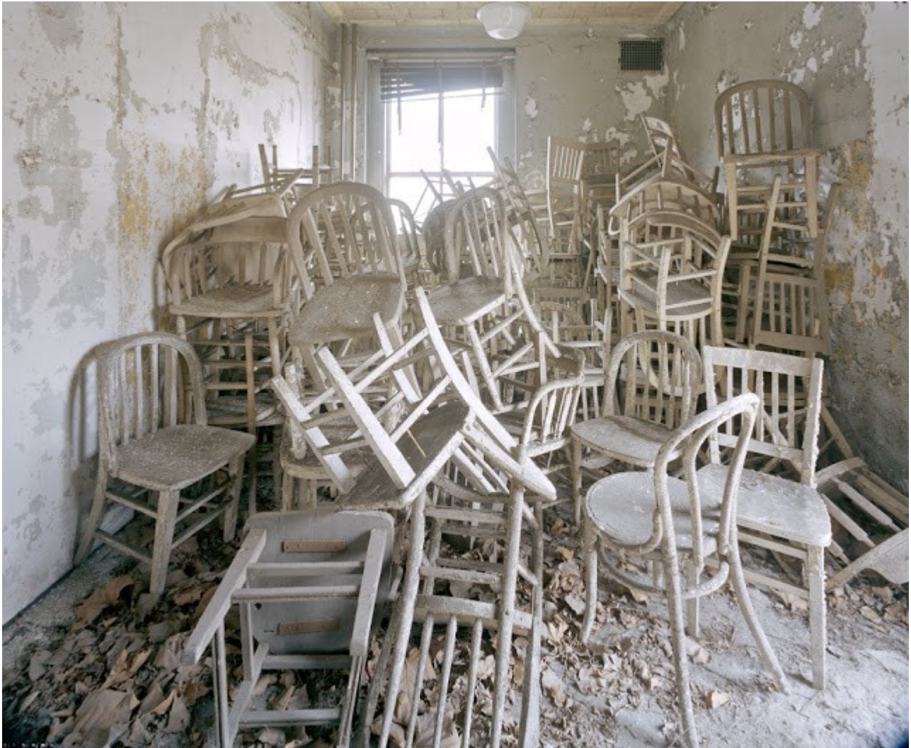
Ellis Island, 1998