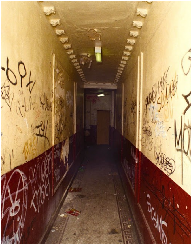
211 West 148th Street, Harlem

Racioppo's images help document the city's most changing neighborhoods, such as those in central and East Harlem and the South Bronx, a neighborhood known in the 1970s and 1980s by its frequently burned-out lots and entire blocks blighted by arson. At the time, when building owners could no longer afford repairs—or when squatters had taken over—the land was usually worth more when the structures were razed by fire.