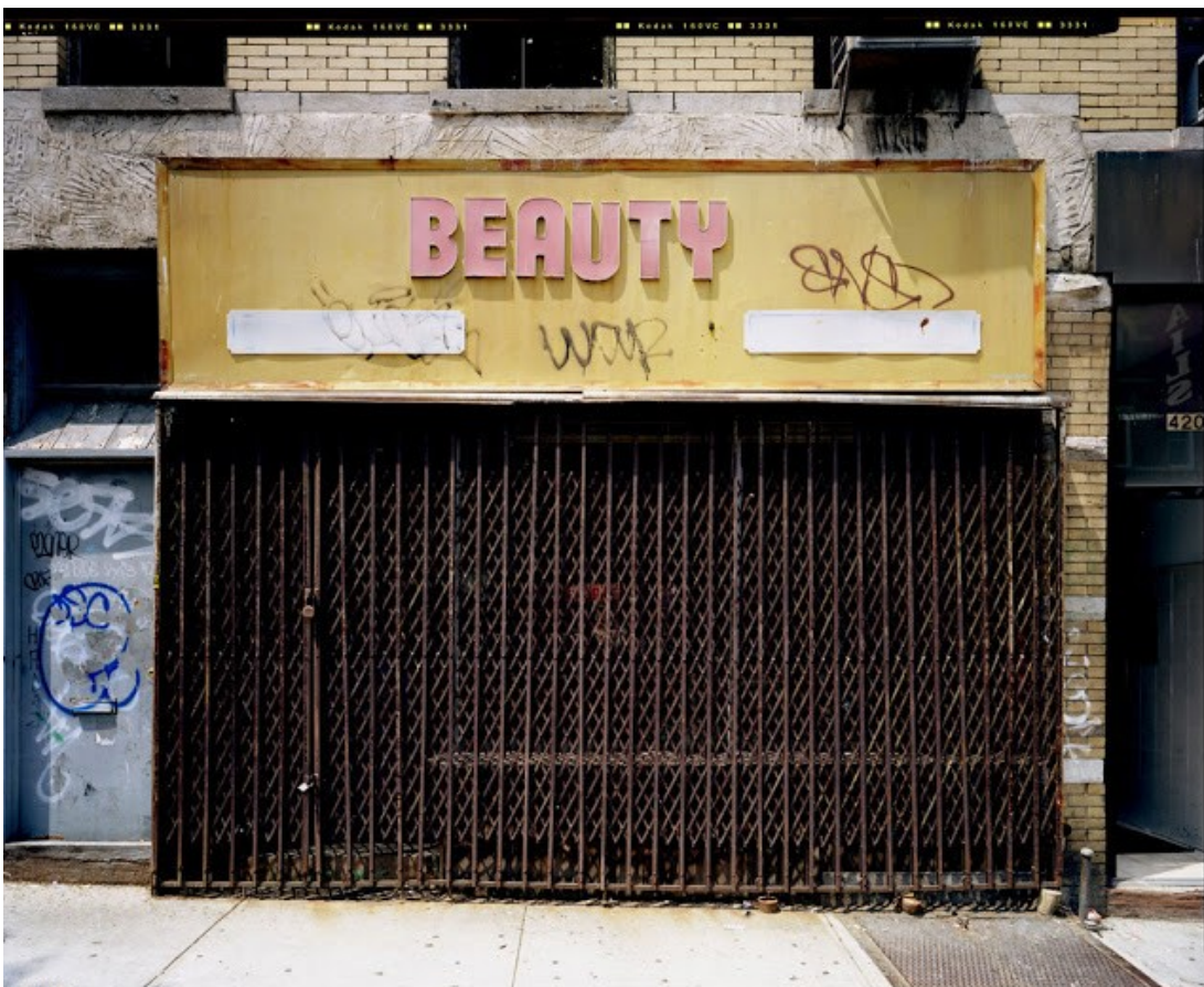
Sunset Park, Brooklyn, 2006

"I was in California and a friend of mine lent me his camera," he said. "This was in 1970. Shortly after, I purchased a Nikon for $35. I had a choice between two, and though I knew nothing about either, I held each in my hands and the Nikon was much heavier, so I bought it. I only took one basic photography course at the School of Visual Arts, but I stuck with it. Nothing else was ever as much fun."