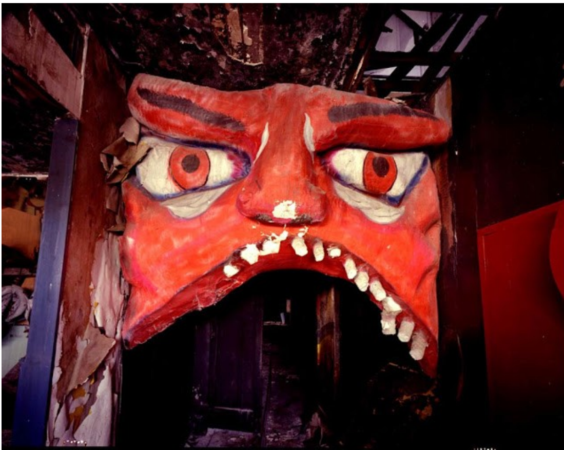
Coney Island Spookhouse, Brooklyn, 1997

"I was in California and a friend of mine lent me his camera," he said. "This was in 1970. Shortly after, I purchased a Nikon for $35. I had a choice between two, and though I knew nothing about either, I held each in my hands and the Nikon was much heavier, so I bought it. I only took one basic photography course at the School of Visual Arts, but I stuck with it. Nothing else was ever as much fun."