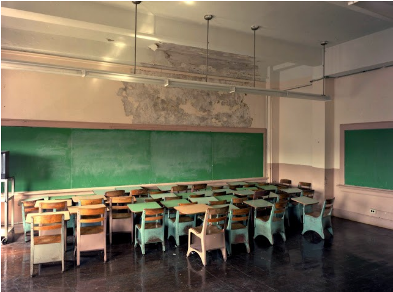
St. Michael's School, Brooklyn, 2005