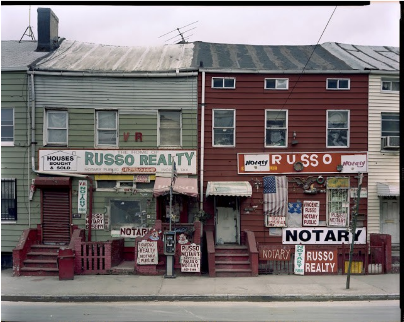
Smith Street, Brooklyn, 2004

On this rainy New York day, it's the perfect time to launch the new column, " Metropolitan Lives. " We'll take a look at New Yorkers with great personal stories --- many whom have shaped this town or contributed to the City of the past, present, or future.