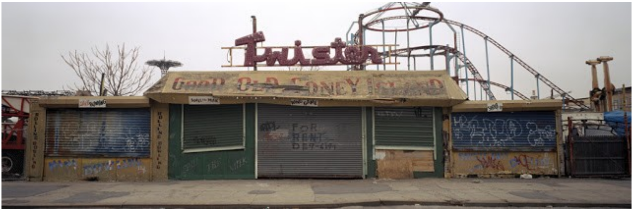
Coney Island, 1990

His photography gave him access to some of New York's finest city-owned buildings, often in serious states of decay. The results were as shocking as they were powerful, evoking an older, more eloquent New York. Racioppo retired from the DHP position last September.