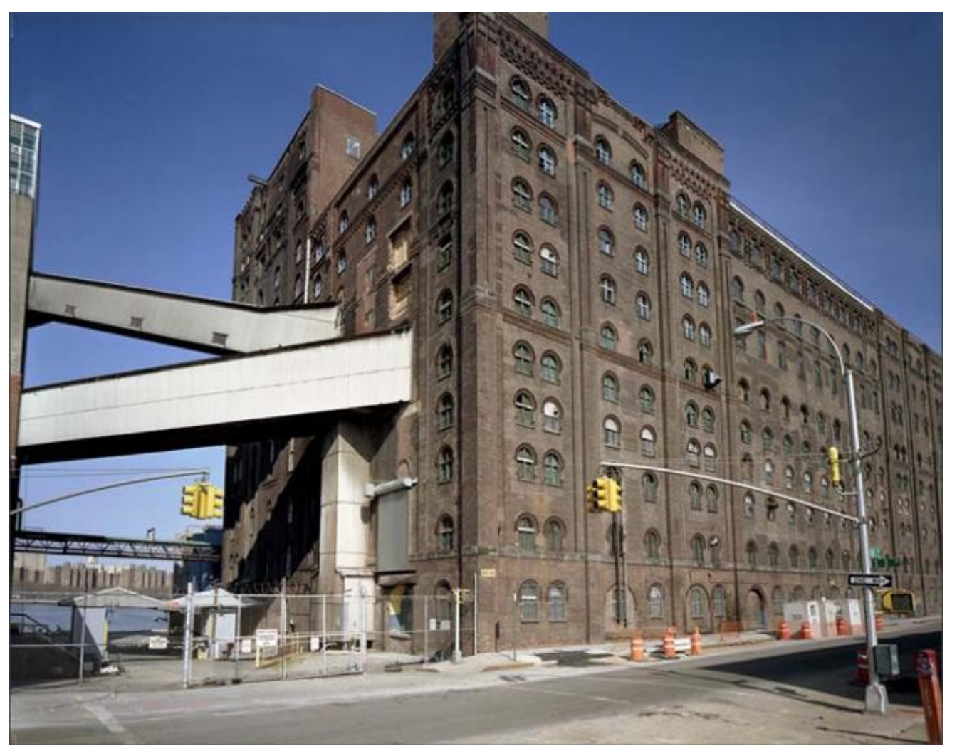
The Domino Sugar Plant Exterior

I photographed at the Domino Sugar Plant in the mid 1970's when it was a working plant. I had to wear earplugs because the noise was deafening. The Plant was built in 1884 and closed in 2004. Returning to an empty and silent building was eerie. There are current plans to create housing on this Williamsburgh site right on the East River.