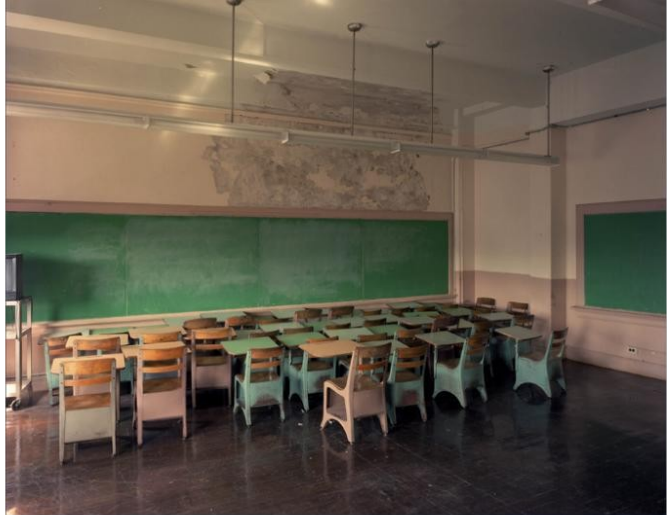
St. Michael the Archangel Classroom

I went to a similar school, St. Michael the Archangel in Sunset Park, which also has been closed.