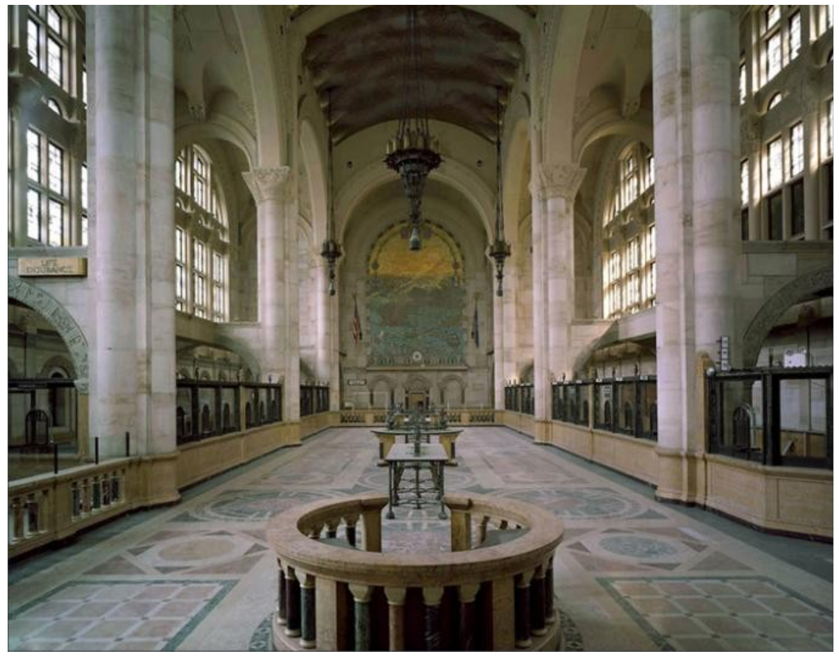
Williamsburg Savings Bank Lobby

I had my first savings account at the Williamsburg Savings Bank, a Brooklyn landmark. Located in Fort Greene and built in 1929, this Art Deco building no longer has an active bank. It now features a mixture of luxury residences and older offices. The lobby is a rental venue.