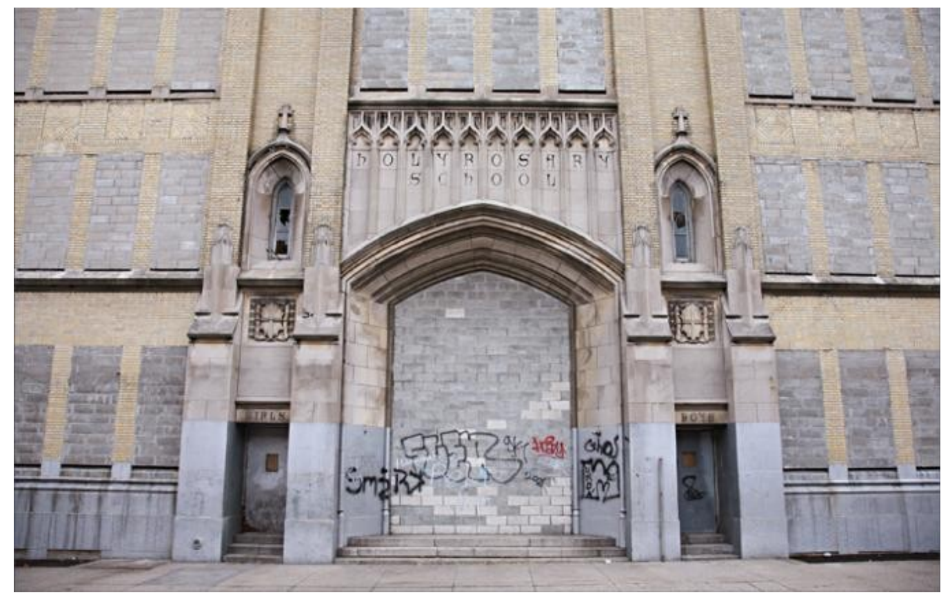
Holy Rosary School Exterior

In recent years Catholics in New York City have been fighting a losing battle to keep their parish schools open. Increasing costs and dwindling enrollment have resulted in the consolidation or closing of many schools. Holy Rosary School in Bedford Stuyvesant closed in 1995 and is scheduled for conversion to housing.