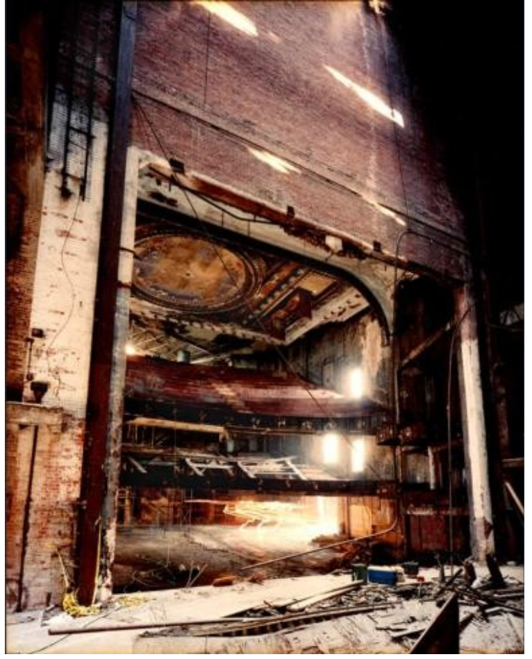
Bushwick Movie Theater Interior