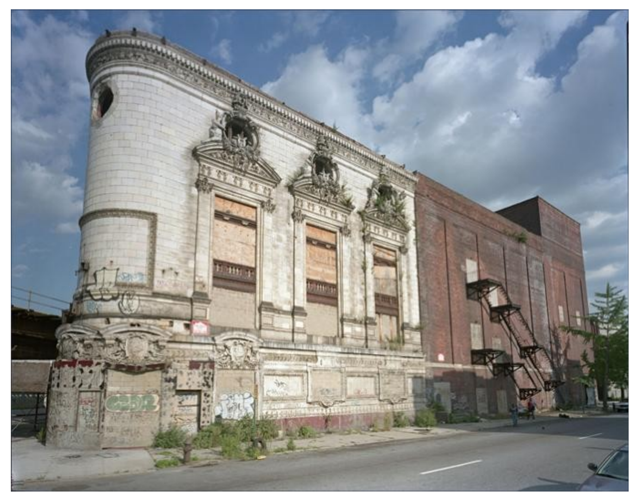
Bushwick Movie Theater Exterior

The Bushwick Theater (formerly the Esquire) opened in 1911 and also closed in 1969. In 2004 it was converted to the Brooklyn High School for Law and Technology. It is located on Broadway, the dividing line between Bushwick and Bedford Stuyvesant.