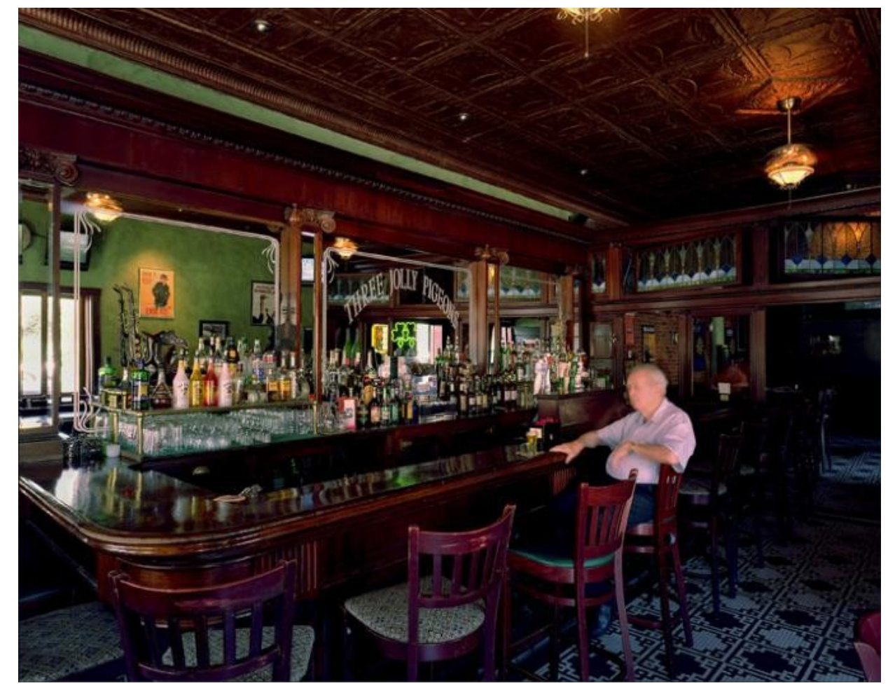
Three Jolly Pigeons Interior

Opened in the early 1900's, the Three Jolly Pigeons Pub in Bay Ridge is an old style Brooklyn bar. Drinks are inexpensive, and it is not crowded during the day.