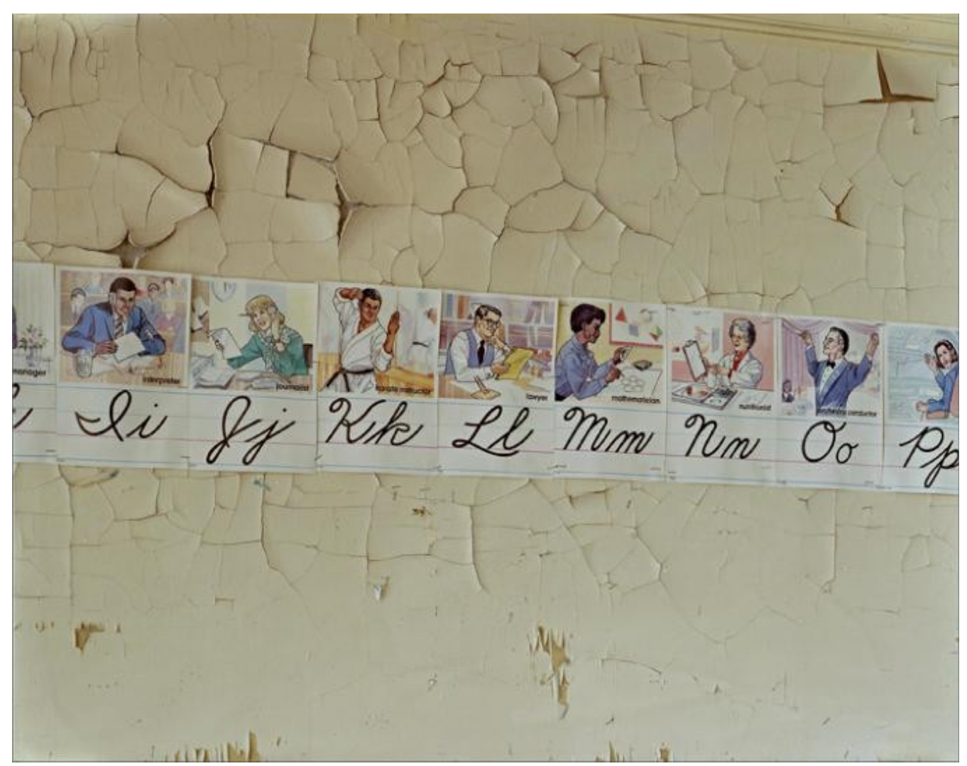
Holy Rosary School Classroom Detail

I went to a similar school, St. Michael the Archangel in Sunset Park, which also has been closed.